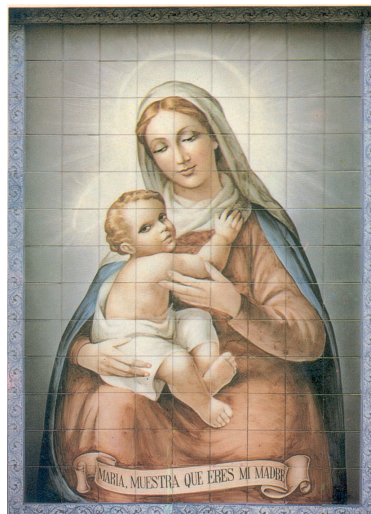
Original ceramic tableau of Our Lady of the Encounter in the Parish of San Andrés Apóstol in Villanueva de los Infantes

« In the same manner that no one comes to the Eternal Father except through the Son, nobody can approach Christ, the Son, but through Mary. Let us cultivate the devotion to Mary, let us turn to Mary in order to find God. God cannot be found but through the Lady that is the door, the pathway to God to enter the world of man and the entrance of man to the realm of God ». (23-5-1981).